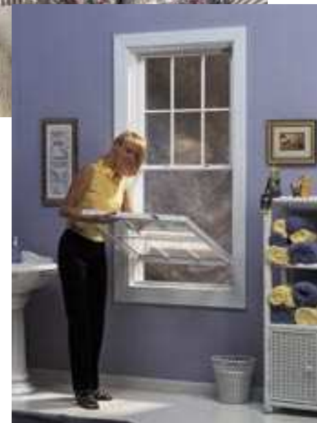
Our fusion welded double-hung windows offer beauty, maintenance freedom, and peace of mind at a price you can live with.