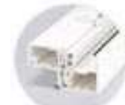
Meeting rails with Integral sash interlock.

Beauty, Comfort, Value enjoy living in greater beauty and comfort, and increase your home's value today.