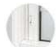
Ventilation limit latch and tilt-latch.